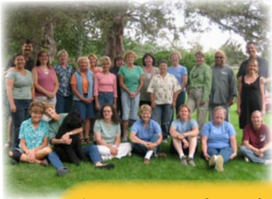
I get to meet others who share my point of view.