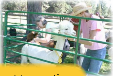
I get to save time.