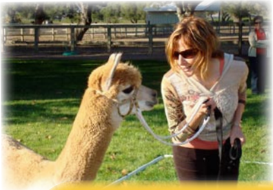
I get to have a better relationship with my alpacas and llamas.