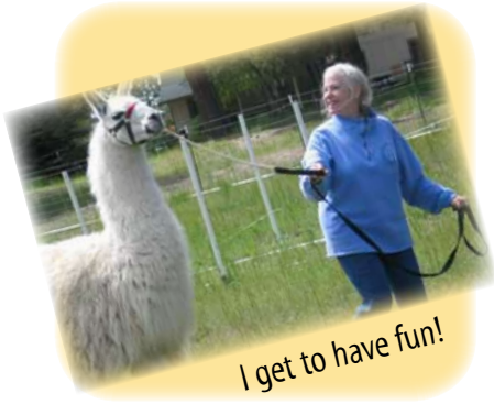
I get to have fun!