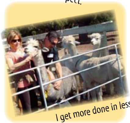
I get more done in less time.