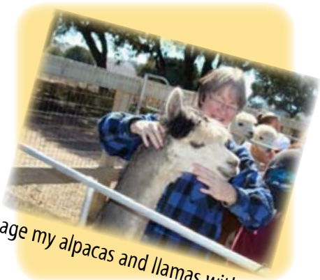
I manage my alpacas and llamas with respect.